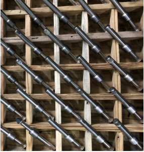
Choke Beans & Adapters